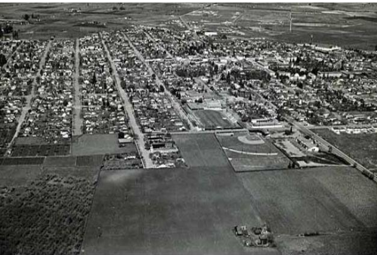
Chronicle / Bill Young, 1947